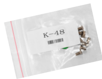
K-48 screw kit