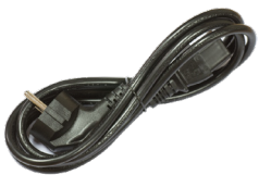
2 IEC cords